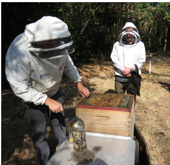
HONEY BEE COLONY

No food is harvested, just oilseeds which our countries do not consume. It is used by distant nations from other continents either to fatten livestock or as agrofuel. These transgenic seeds have damaged 11.000 years of wisdom and hard work by contaminating natural seeds and affecting peasant's crops. The world's hunger is not going to end with this fantasy created by the agro-industrial model but with an adequate distribution of food and wealth.