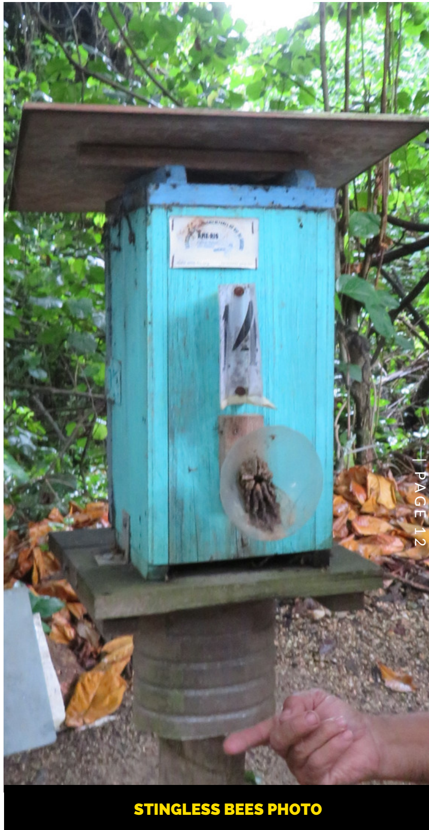
STINGLESS BEES PHOTO

We believe that this problem should be given the importance it deserves, Latin Americans should be aware of the negative consequences that the decrease in the bee's population will bring in the present and the future. As Latin Americans, we should demand our governments to put an end to this unrestricted use of agrochemicals that are harmful to pollinating insects and allow us to produce organic food in a sustainable way.