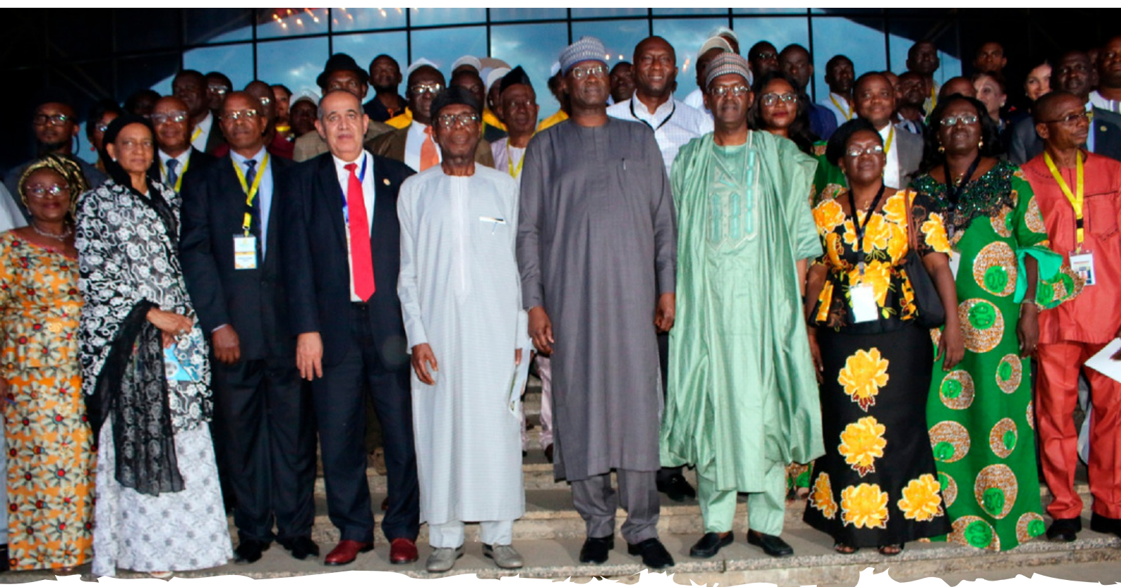
Guest of Honour, Hon. Chief Audu Ogbeh (Minister of Agriculture & Rural Development) after the ApiExpo Africa 2018 . Official Opening Ceremony in Abuja, Nigeria

Unfortunately, beekeeping and honey industry in South Africa is still having a number of challenges that need to be overcome. The Regional Commission had meetings with South African Bee Industry Organisation (SABIO) and Department of Agriculture, Forestry and Fisheries (DAFF) to share on how best the industry can be grown to levels that will see rural communities benefit. This is in supporting the government’s vision to create jobs and empower households especially from the Historically Disadvantaged Individuals (HDIs). The country has a population of 18 million people dependent on social grants and these are mostly concentrated in the rural South Africa. These communities have natural resources capable of supporting beekeeping initiatives that can provide them with an alternative source of livelihood, thus DAFF called for the first ever National Beekeeping Workshop that was held on 13th to 14th November 2018.