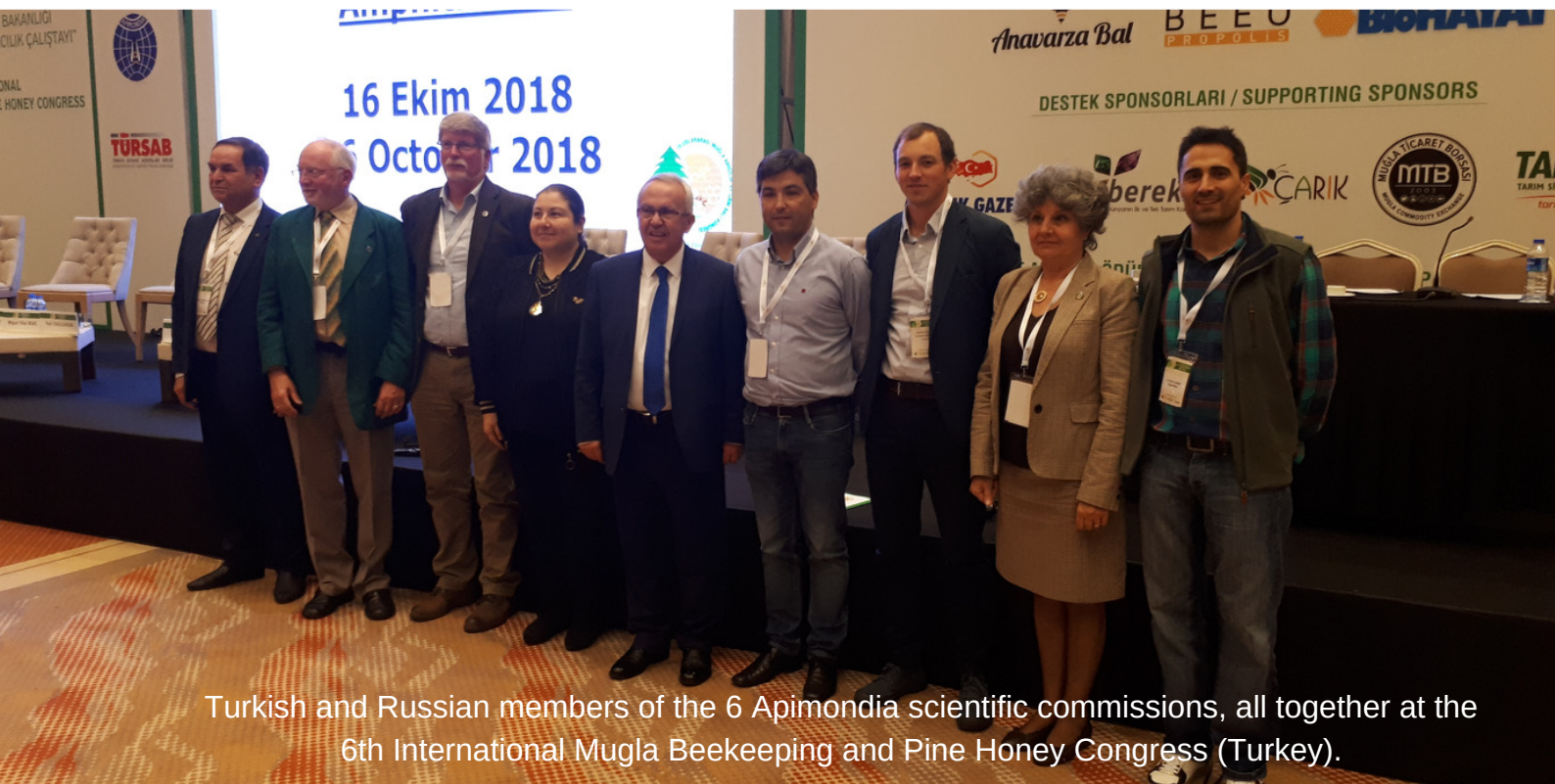
Turkish and Russian members of the 6 Apimondia scientific commissions, all together at the 6th International Mugla Beekeeping and Pine Honey Congress (Turkey).